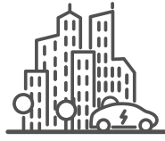
Complete EV charging infrastructure